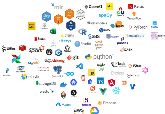
Fig-3 : Open Source Software

Data scientists are leading the modus operandi in terms of model building via using various technology approaches. They are making use of open-source analytics technologies such as ‘R’ and Python as a significant ingredient of the advanced analytics efforts. Commercial analytics products are also being arranged by a lot of, and some use open source in coincidence with commercial platforms.