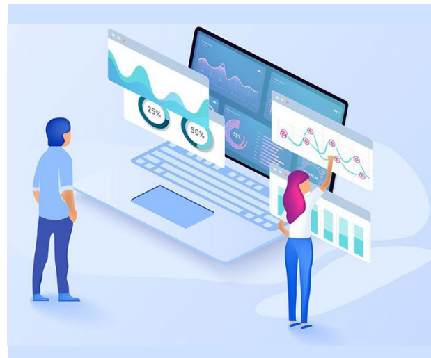
Fig-4 : Business Data Analytics

Analytics applications more often take account of built-in AI/ML algorithms that are targeted to make it easier for business analysts and users to find insights. These embrace natural-language-based search interfaces, automated suggestions, and automated model building. Early adopter experience provides clues as to best practices for those getting started with these technologies to gain advantage more quickly. For instance, early adopters are building centers of excellence (CoEs) and are hiring data scientists and analytics leaders. They are focused on data quality for analytics, operationalizing their analytics, and providing training opportunities. Generally, one thing is comprehensible that organizations are utilizing these technologies and are in advance value thereof. In fact, early adopters are much more liable to be fulfilled with their analytics deployments than those that are just getting started with more advanced analytics or those that have no plans. Organizations are also seeing value as they move throughout the analytics success cycle.