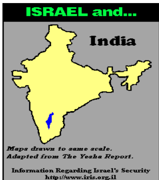
Figure 3: Comparative study of Israel, India and US area wise. Blue spot: Israel